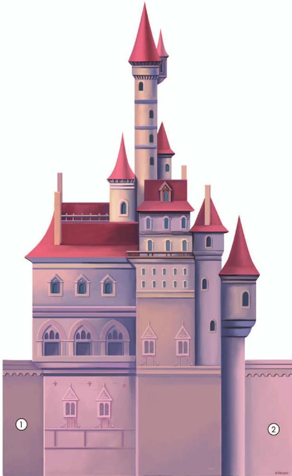
BACK PANEL OF CASTLE