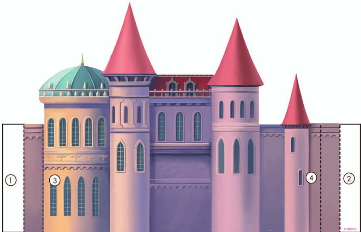
MIDDLE PANEL OF CASTLE