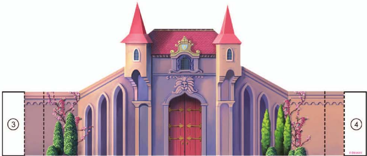
FRONT PANEL OF CASTLE