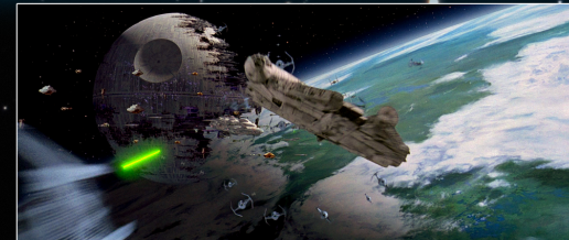
BATTLE OF ENDOR