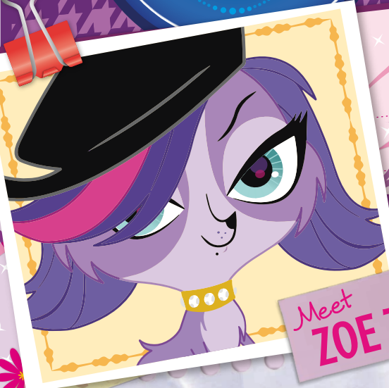
Meet ZOE TRENT™

Hello! What a week — I've been so busy designing new outfits for all the pets! To get inspired, I'm reading fashion magazines with Zoe. She always knows what's in style. She's my most enthusiastic model, too. When she walks down the runway, she sings and dances all the way! Zoe knows she's a superstar!