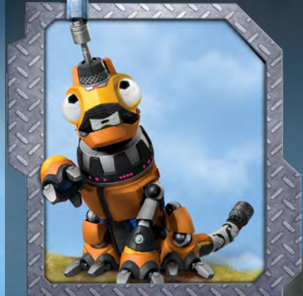
CLICK-CLACK — LIZARD + ROTARY DRILL

Despite his fears, Click-Clack's loyalty is rock solid.