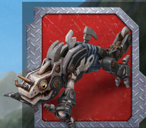
SKRAP-IT — LIZARD + LEATHERMAN TOOL

Skrap-It, D-Structs' loyal repairman, might be small but can turn almost anything into scrap parts.