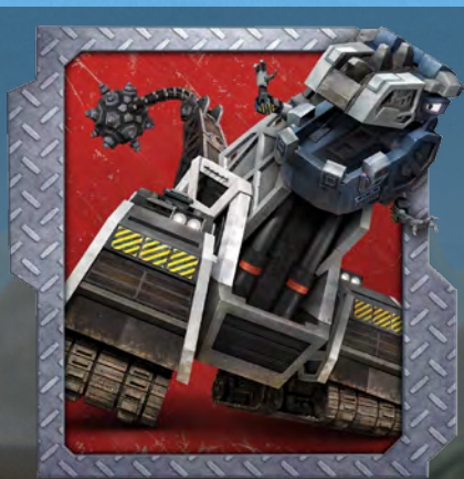
D-STRUCTS — TYRANNOSAURUS REX + EXCAVATOR

D-Structs, the biggest and baddest T-Trux, battles Ty and the team to protect his crater – and ore.