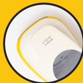
2.5" diameter hole punch