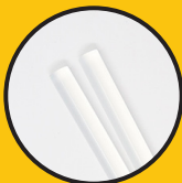
Hot glue/ glue gun