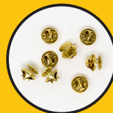
Lapel pin backs