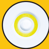
Double stick tape