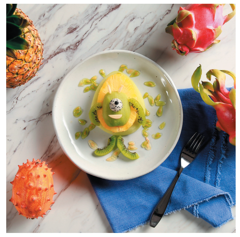
Recipe inspired by Disney and Pixar Monsters Inc.