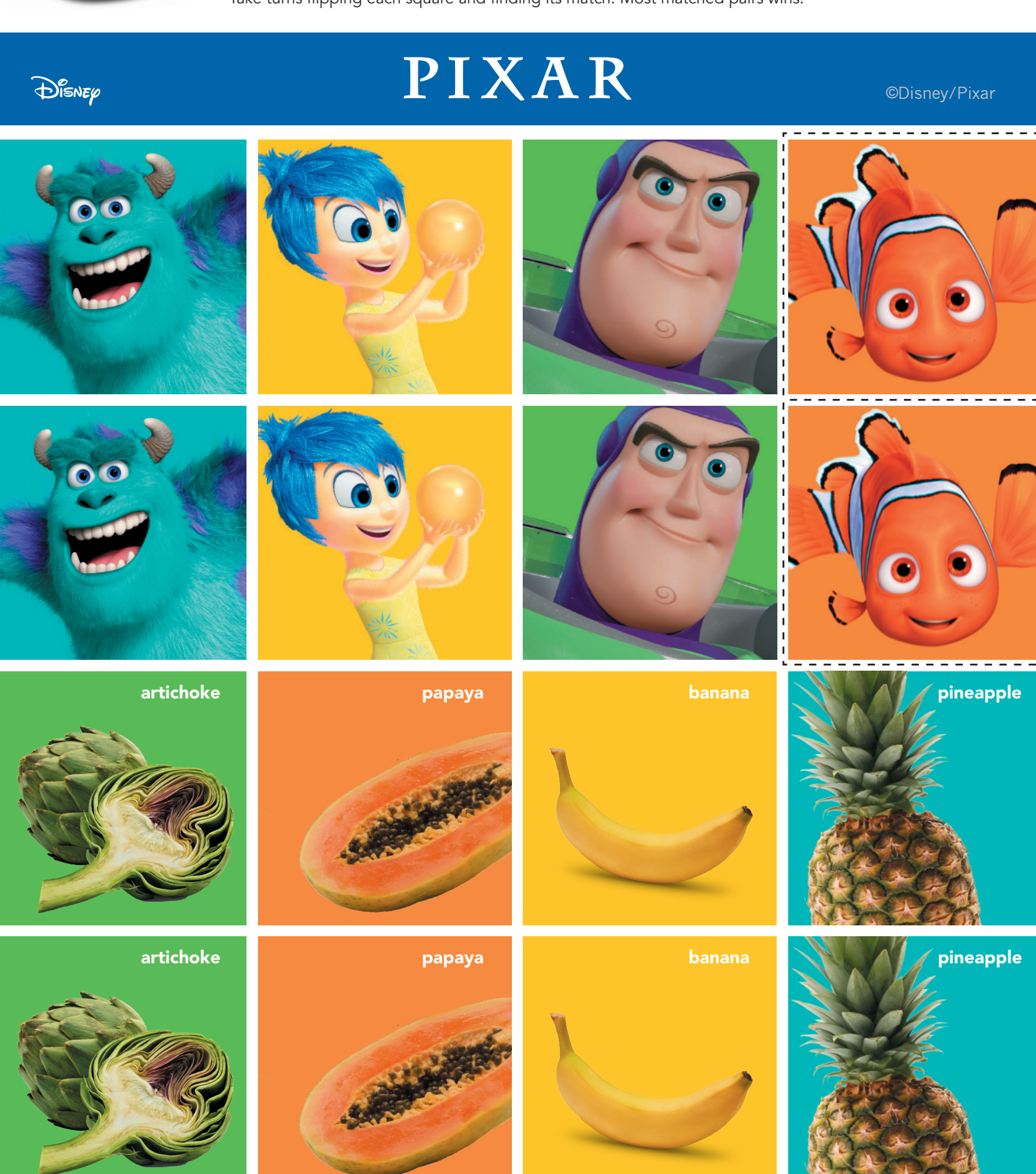
DID YOU KNOW? Bananas are a good source of manganese, which supports energy metabolism.

Improve your memory and challenge your friends to a game of matching the Pixar characters and Dole fresh fruits and vegetables. Cut out each square and put them face down to start the game. Take turns flipping each square and finding its match. Most matched pairs wins!